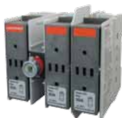
M30CC12 30A, CC fused, 3-pole with pole on left side of handle and 2 poles on right side