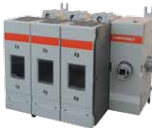
M60J30 60A, J fused, with 3 poles on left side of handle