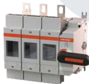
M200J30 with HDF200 200A, J fused, 3 poles on left side of direct handle